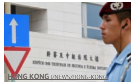
HONG KONG (/NEWS/HONG-KONG)

22 Feb 2016 - 9:35am 3 (/news/hong-kong/politics/article/1916507/parents-sacked-during-chinas-one-child-policy-petition#comments)