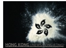
HONG KONG (/NEWS/HONG-KONG)

24 Feb 2016 - 4:54pm 39 (/news/hong-kong/politics/article/1914638/revealed-hong-kong-residents-mainland-authorities#comments)