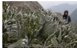
HONG KONG (/NEWS/HONG-KONG)

22 Feb 2016 - 6:10pm 48 (/news/china/policies-politics/article/1915220/outspeken-chinese-tycoon-comes-under-fire-attacking-xi#comments)